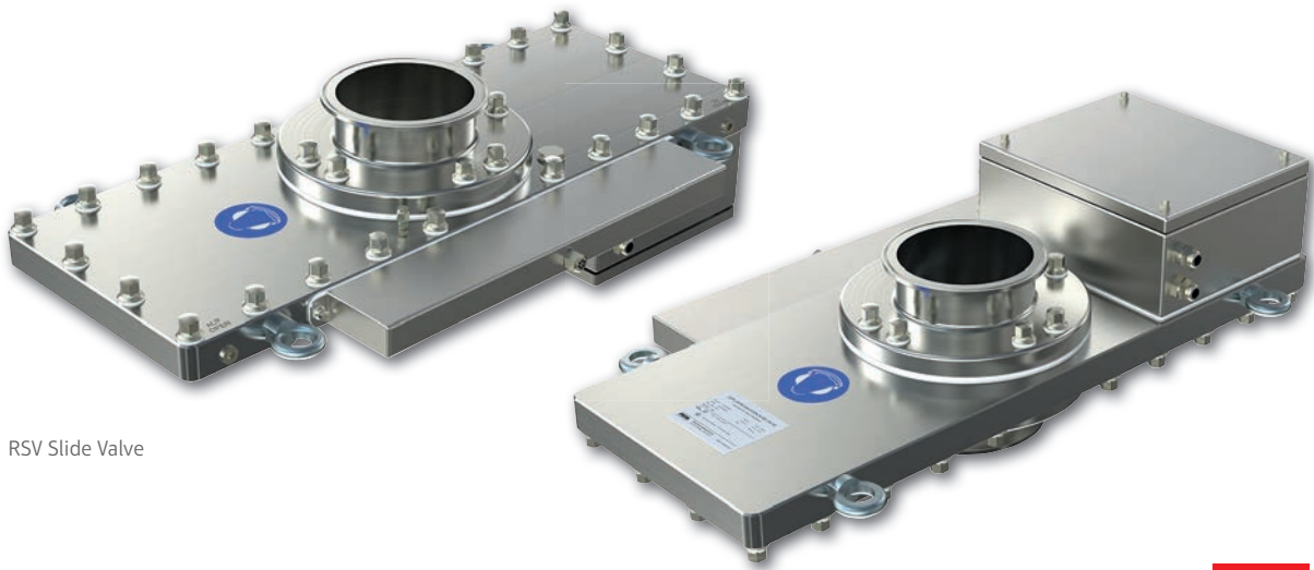
RSV Slide Valve

The REDEX® Slide is available in nominal pipe sizes from DN 80 to DN 150, the RSV slide valve in nominal pipe sizes from DN 50 to DN 400. Thanks to their practical design, both knife gate valves are suitable for all flow velocities and dust loads, they do not cause any pressure drop, and can be installed vertically, horizontally or at any angle.